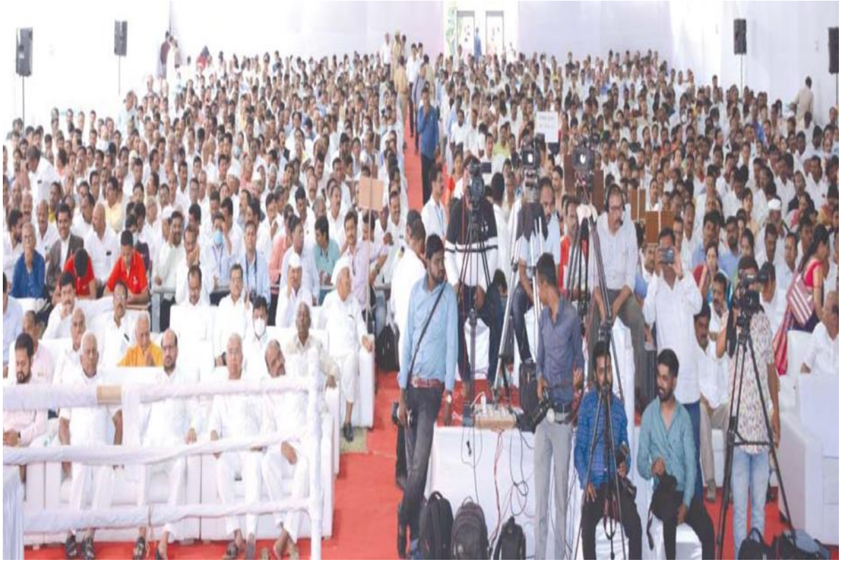
Presence of large numbers of audience including students during the conference during the conference entitled “State Level Sugar Conference 2022 (4-5 June 2022)”