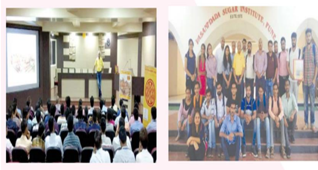
Seminar talk to students during the programme (Left) & group photo of participants and faculties involved in the activity (Right) (19 th April 2018)