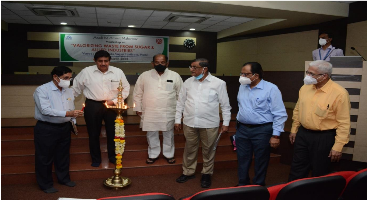
Lighting of the lamp by the guests during the inauguration of the programme for programme entitled “Valorizing waste from Sugar & Allied Industries (31 st March 2022)