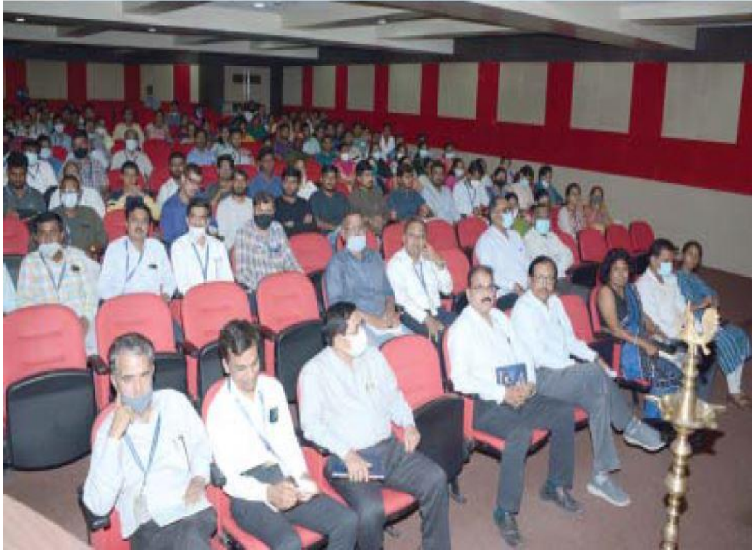
Presence of large numbers of audience including students during the programme entitled “National technology day: theme-integrated approach in science & technology for a sustainable future (11 th May 2022)