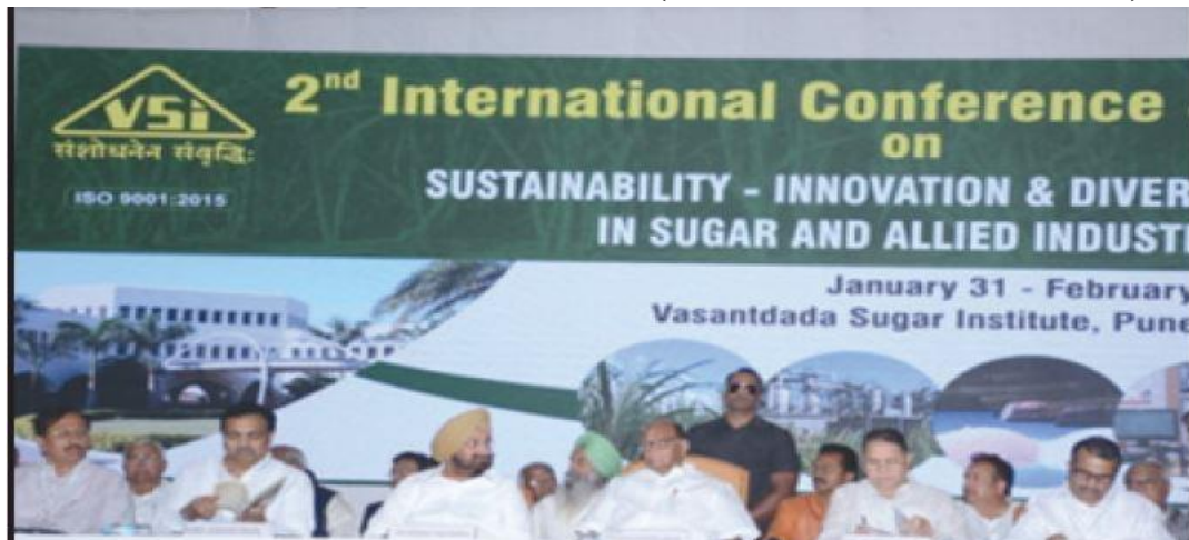
Figure showing conference banner & speakers & distinguished guests sitting on the dias during inauguration of the conference entitled “2 nd International Conference & Exhibition on Sustainability – Innovation & Diversification in Sugar and Allied Industry (31 st Jan 2020-2 nd Feb 2020)