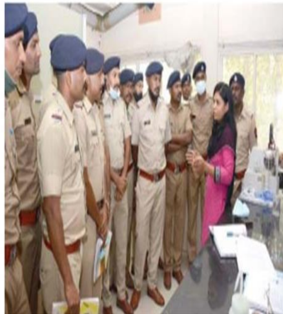
Faculties giving training to excise people who were part of the programme entitled “Overview of Distilleries and Alcoholic Beverage Industry (18 th Feb 2022)