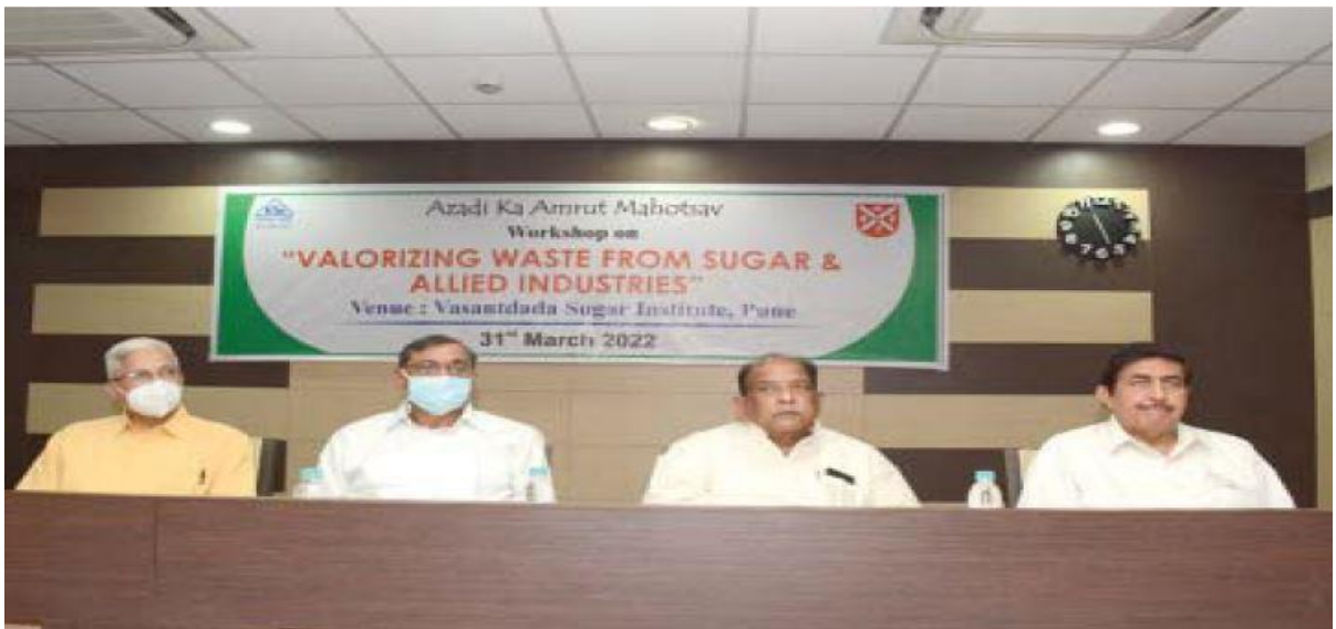
Guests sitting in the dais during the programme with presence of programme banner on their backside for programme entitled “Valorizing waste from Sugar & Allied Industries (31 st March 2022)