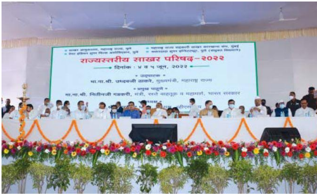
Distinguished guest sitting on the stage during the inaugural function (4-5 June 2022)