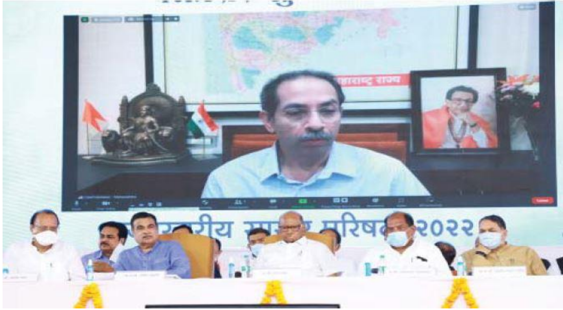
Hon. Chief Minister of Maharashtra Shri Uddhav Thackeray during his online speech during the conference entitled “State Level Sugar Conference 2022 (4-5 June 2022)