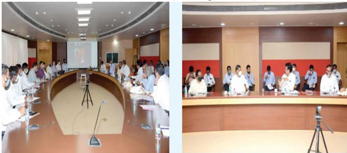
Discussion between faculties, distinguished guests during the programme entitled “Use of Retro Fitment Kits for Compressed Biogas (CBG)/Compressed Natural Gas (CNG) for Agricultural tractors (30 th August, 2021)