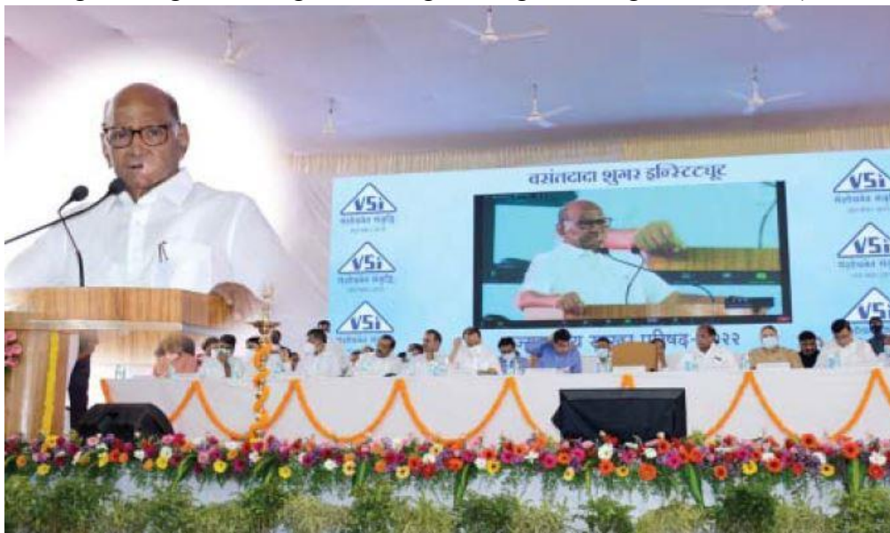
VSI President Hon Shri Shardchandraji Pawar delivering of his speech (4-5 June 2022)