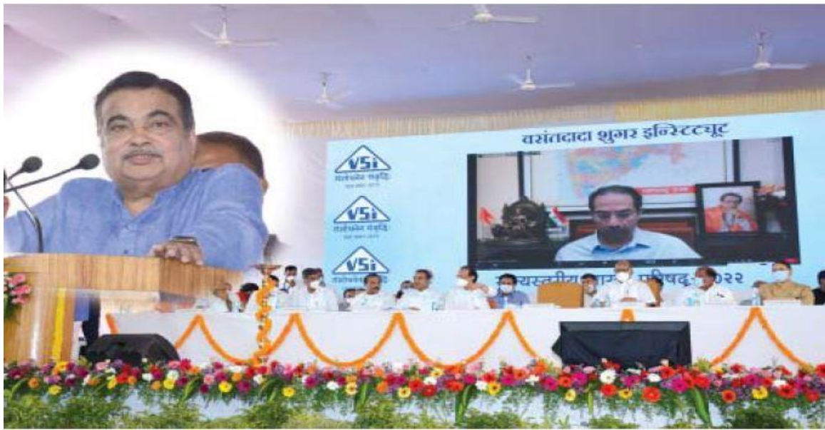
Chief guest Shri Nitin Gadkari, Hon. Minister for Road Transport, Highways & Shipping, Government of India during the conference entitled “State Level Sugar Conference 2022 (4-5 June 2022)