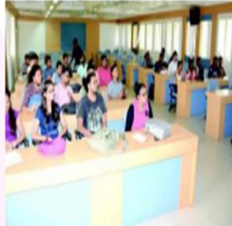
Seminar talk to students during the programme on United States of America work Experience Programme in Wine (14 th January 2019)