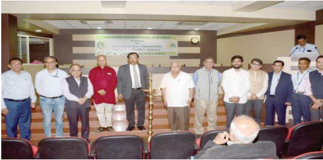
Director General with other distinguished persons during lamp lighting during the inauguration of the workshop (18 th December 2022)