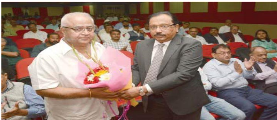
Director General, VSI felicitating the guest and image showing the presence of large numbers of audience (18 th December 2022)