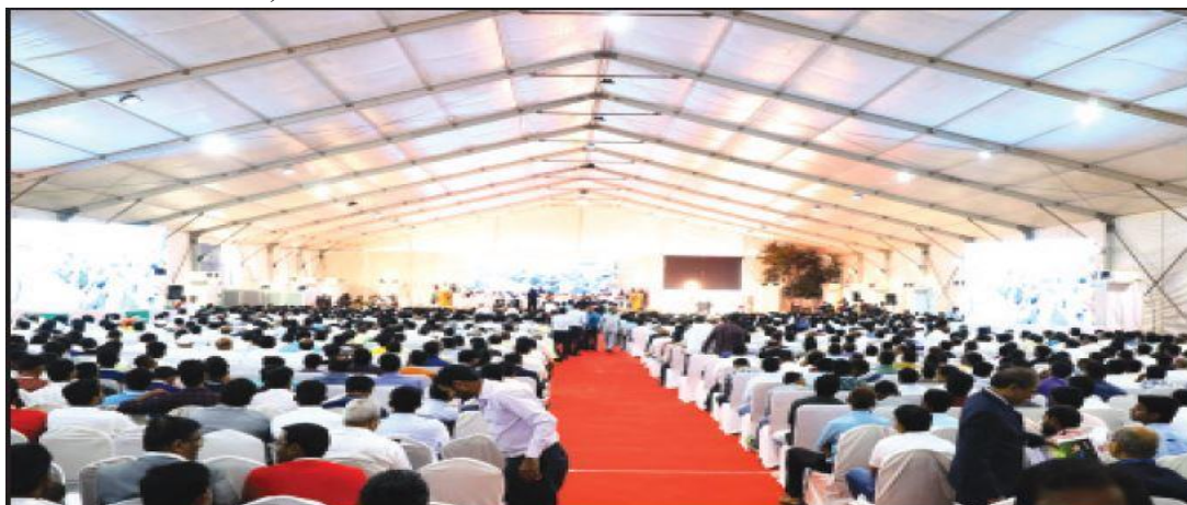
Presence of large numbers of audience including students & faculties during the conference entitled “2 nd International Conference & Exhibition on Sustainability – Innovation & Diversification in Sugar and Allied Industry (31 st Jan 2020-2 nd Feb 2020)